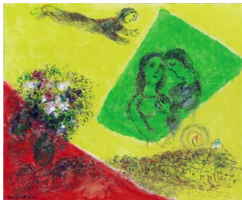
MARC CHAGALL Les amoureux au carré vert Circa 1970/1975 Oil on canvas - 60 x 73 cm Estimate : 1 300 000- 1 600 000 € 13 200 000 - 16 500 000 MAD

Viewing at La Mamounia in Marrakech will take place from 26 to 30 December, the day of the sale.