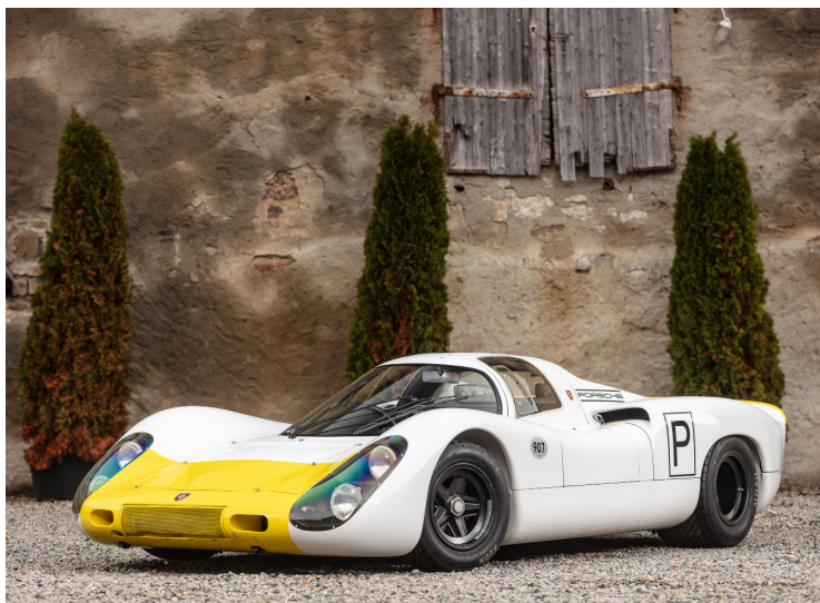
1968 Porsche 907 (est : 4 000 000 - 6 000 000 €)