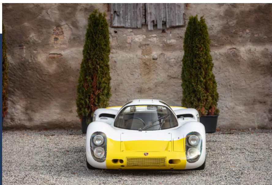
1968 Porsche 907 (est : 4 000 000 - 6 000 000 €)

The 911 RSR 3.0 has also enjoyed a successful career in major endurance events (Le Mans 24 Hours, Nürburgring 1000 km), driven by Neuhaus, Stommelen, Barth, Fitzpatrick and Hezemans to name but a few.