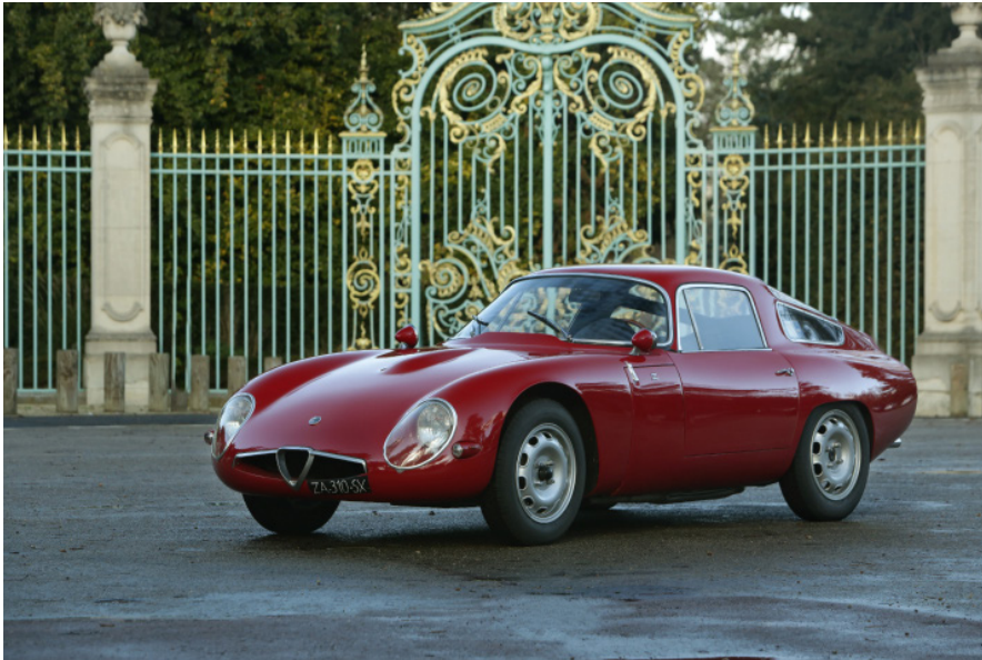
1965 Alfa Romeo Giulia TZ (est : 1 200 000 - 1 400 000 €)