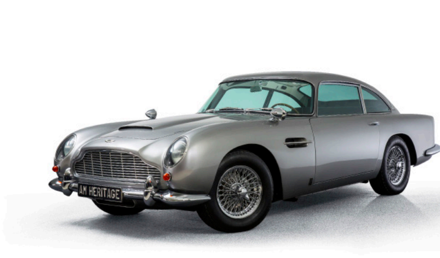
1963 Aston Martin DB5 by Touring (est : 600 000 - 800 000 €)

No Aston Martin collection would be complete without a DB5 . This example, from 1963, was completely restored by Aston Martin Heritage Paris and is presented in spectacular condition. A 1961 DB4, a 1959 DB2/4 MkIII and a V8 EFI complete this very special group of cars.