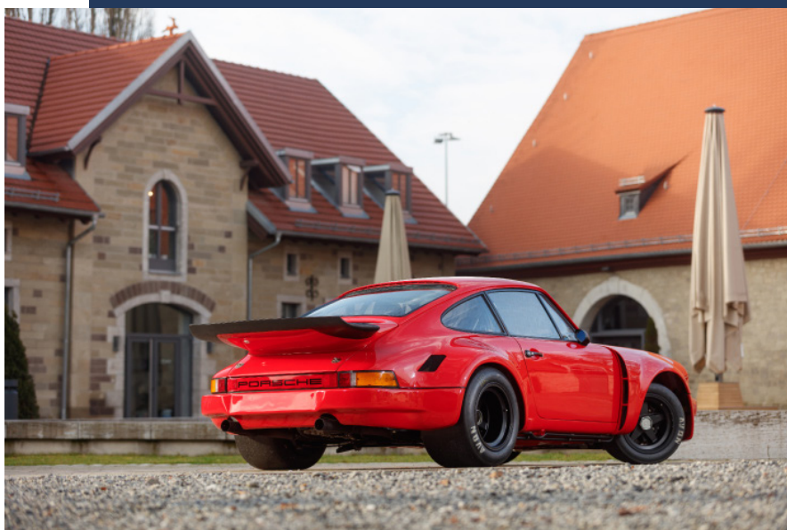
1974 Porsche 911 Carrera RSR 3.0L (est : 1 800 000 - 2 400 000 €)