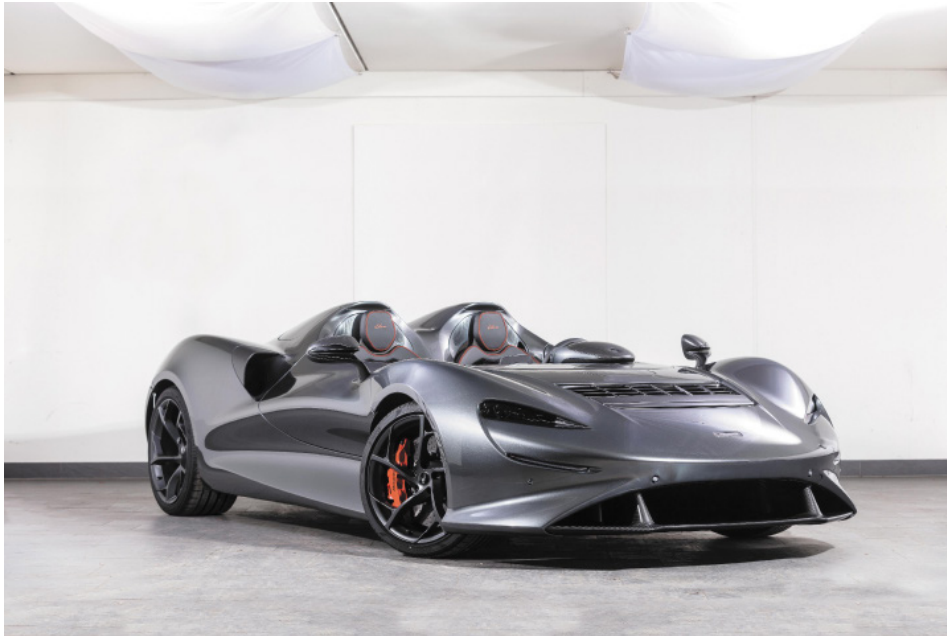
2020 McLaren Elva (est : 1 500 000 - 2 000 000 €)

Finally, one of just 149 examples built, the 2020 McLaren Elva supercar is a mechanical masterpiece designed for pure speed, its aerodynamic form inspired directly by F1 technology. The Elva allows two people to experience the sensations of an F1 single-seater on the open road. What's more, this as-new example has just 10 kilometres on the clock!