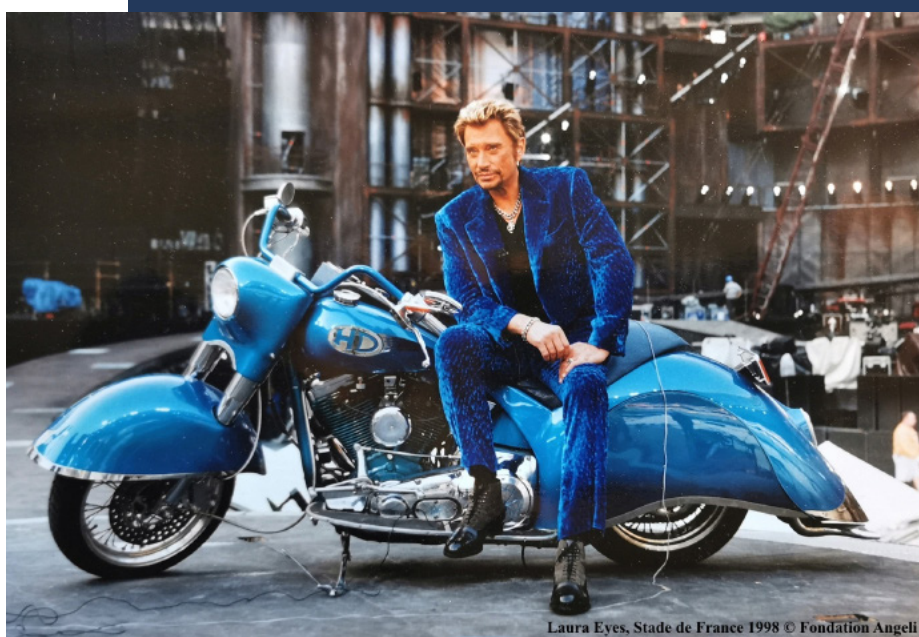
Laura Eyes, Stade de France 1998 © Fondation Angeli

1990 Harley-Davidson Softail Heritage 1340 « Laura Eyes » Ex-Johnny Hallyday (est : 50 000 - 250 000 €) © Fondation Angeli