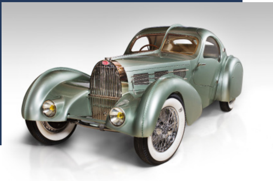
1935 Bugatti Type 57, « Aérolithe » replica body (est : 1 500 000 - 3 000 000 €)

The Bugatti Type 57 with “Aérolithe” replica body is an amazingly faithful copy of an automobile that has become legendary: the Bugatti 57 Aérolithe. With avant-garde styling inspired by the Art Deco movement, this magnesium-bodied model with its riveted spine, was a forerunner of the most expensive Bugatti in the world, the Atlantic.