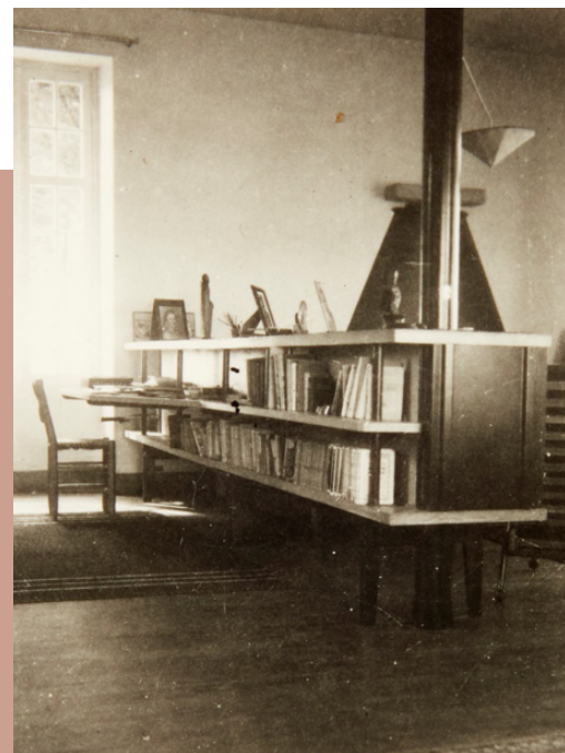
Cabinet in situ in August 1954