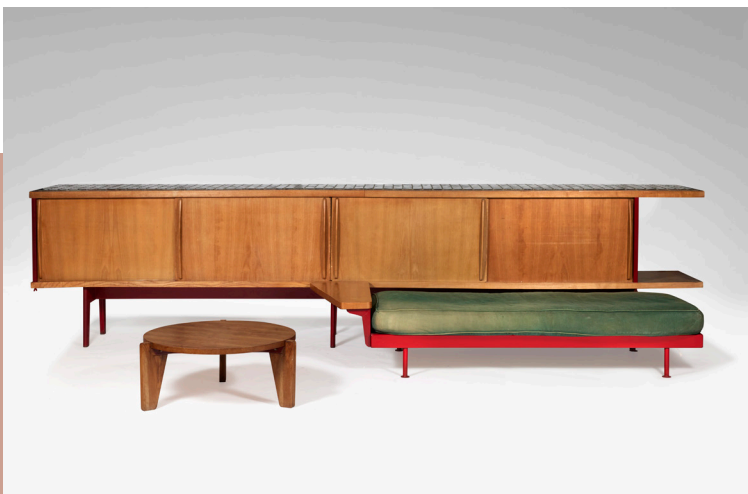
Jean PROUVÉ & Henri PROUVÉ (1901-1984 & 1915-2012) Large double-sided partition cabinet - Circa 1950 Comprising on one side, a sideboard with sliding doors and on the other, bookcase shelving extending into a desk. Red lacquered, folded sheet metal, oak sliding panels and shelves, oak-framed top laid with Villeroy & Boch black ceramic tiles and cement. Sideboard : 104 x 432 x 60 cm Bookcase : 75 x 195 x 24,5 cm Desk : 75 x 190 x 64,5 cm Estimate : 200 000 - 300 000 €