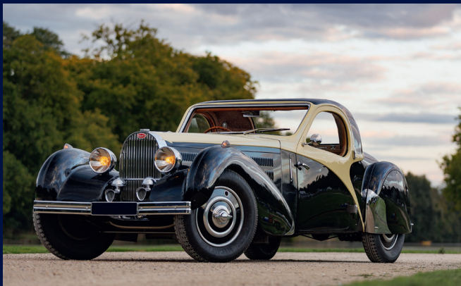
1936 Bugatti 57 Atalante

Une des quatre Atalante livrées neuves avec toit ouvrant