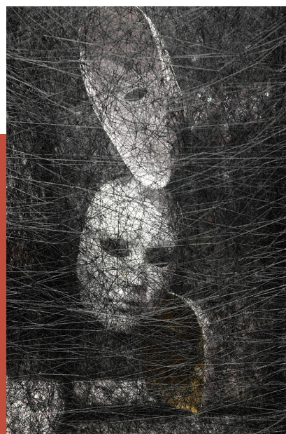
Chiharu SHIOTA (Japonaise - Née en 1972) State of Being 'Mask' (détail) - 2018 Black wires, masks, metal frame The work is presented with its original base 80 x 45 x 45 cm Estimation : 50 000 - 70 000 €