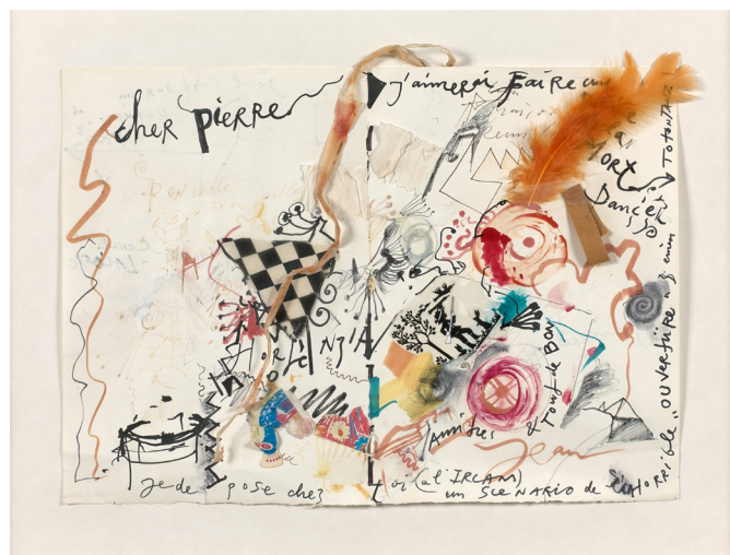
Jean TINGUELY Untitled - 1979-83 Set of 12 works on la Fontaine Stravinsky of 1983 in Paris Estimate : €35,000 - 55,000

His commitment to the arts and creation was hailed a few years later by the Louvre, which held a major exhibition in his honour in 2008, called Pierre Boulez, Œuvre fragment . In 2015, on the occasion of his 80 th anniversary, the Philharmonie de Paris also paid tribute to him through an exhibition bringing together masterpieces by major 20 th century artists: Paul Cézanne, Paul Klee, Nicolas de Staël, Alberto Giacometti, Francis Bacon, Piet Mondrian and André Masson.