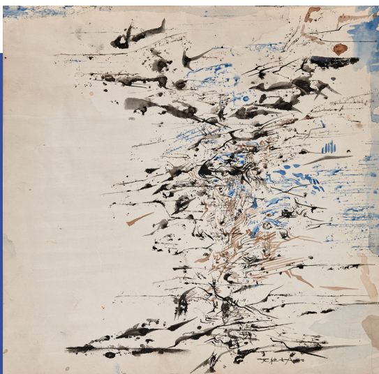
ZAO WOU-KI Untitled - circa 1958 Ink and watercolour on paper Estimate : €20,000 - 30,000