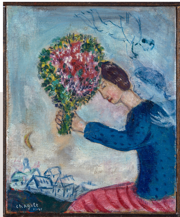
Marc CHAGALL 1887 - 1985 Jeune femme au bouquet de fleurs - 1928 Oil on canvas Signed lower left «Chagall / Marc» 26,50 x 21,80cm (10,4 x 8,6in) Estimate : €550,000-650,000