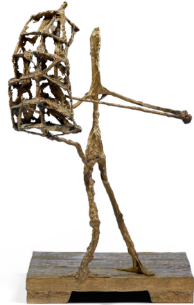
Germaine RICHIER 1902 - 1959 Don Quichotte à l'aile de moulin - 1949 Natural bronze Signed and numbered on the terrace «G. Richier 7/8», stamp of the founder on the edge of the terrace «L. THINOT. fondeur. PARIS» 52,50 x 29 x 29,10 cm Estimate : €80,000-120,000

The Impressionist & Modern auction will open on 7 th June at 7pm with a variety of surrealist works from several private collections, dominated by an outstanding gouache by René Magritte that has remained in the same French collection for forty years, La Saveur des Larmes from 1946, estimated at €800,000 - 1,200,000. Works by Paul Delvaux, Salvador Dalí, Man Ray, Pierre Roy, Félix Labisse and Max Ernst will follow. Also of note is a 1928 painting by Marc Chagall, Jeune femme au bouquet de fleurs , estimated at €550,000 - 650,000, as well as sculptures by Aristide Maillol, Germaine Richier and Baltazar Lobo; special mention should be made of a group of four works from the 1940s by artists from the Hanoi School, Mai Thung Thu and Le Pho, which come from Belgian and French collections.