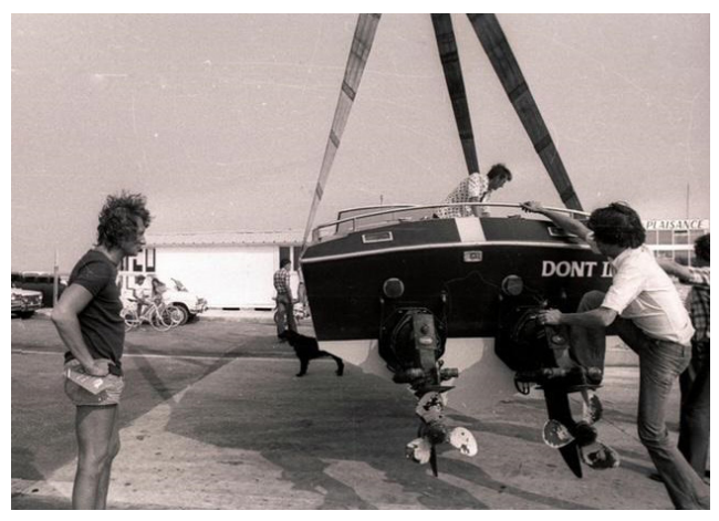
Johnny Hallyday attends the launch of the Bertram Port d'Arcachon summer 1975

1982 Renault 5 Turbo 2 Estimate: 60 000 - 90 000 €