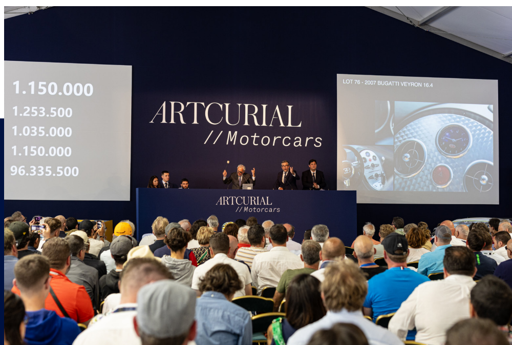
Sale of the BUGATTI VEYRON 16.4 Sold : 1 358 800 € - 1 479 366 $ including premium