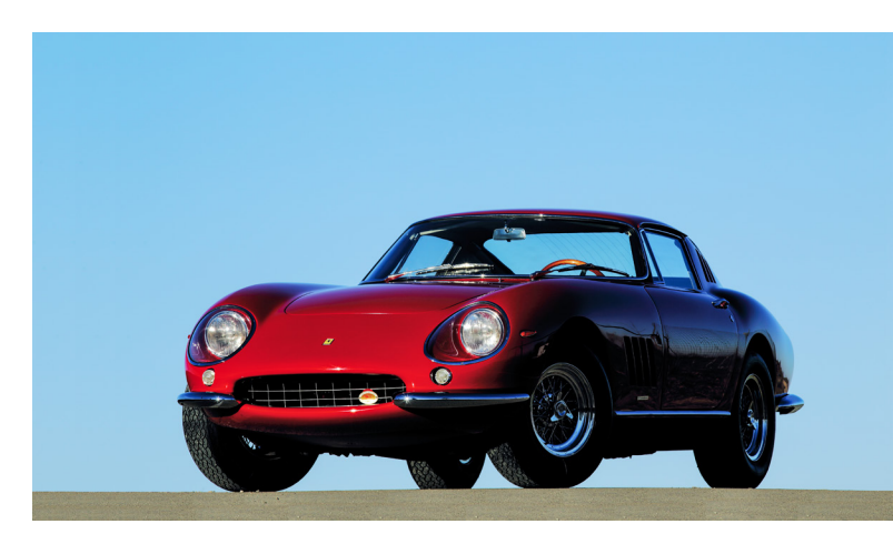
1966 FERRARI 275 GTB Estimate : €1,900,000 - €2,500,000

The two Stars, a 1958 Ferrari 250 GT California LWB (€7,000,000 - €10,000,000) and a 1962 Ferrari 250 GT SWB (€8,500,000 - €12,000,000), will be unveiled publicly for the first time at the Rétromobile show, taking place from January 31 to February 4, 2024, in Paris, offering an exclusive glimpse into the treasures of The W Collection: From Stockholm to Monaco .