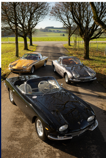
THE GT LAMBORGHINI COLLECTION