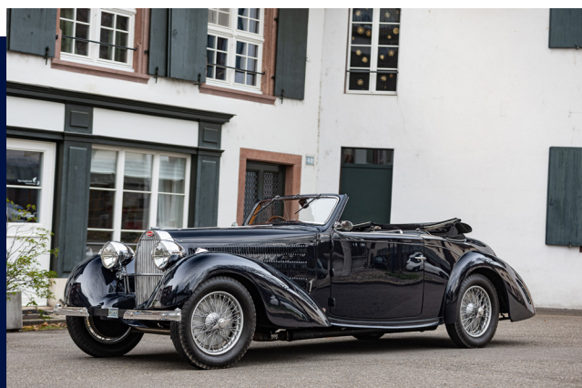
1936 BUGATTI TYPE 57 STELVIO BY GANGLOFF Estimate : €600 000 - 800 000